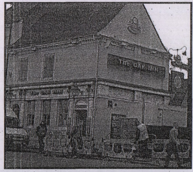
■ LICENCE REVIEW... The Oak Inn in Coventry's Gosford Street which has been plagued with trouble since its licence was extended to 5am. People can carry on drinking long after other venues have closed.